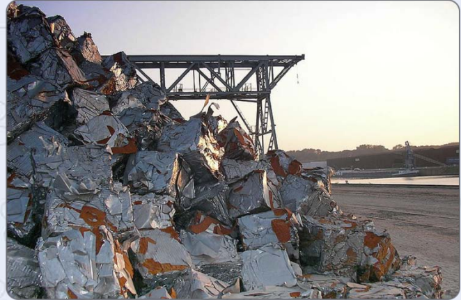
Keywell in providing inventory information on demand